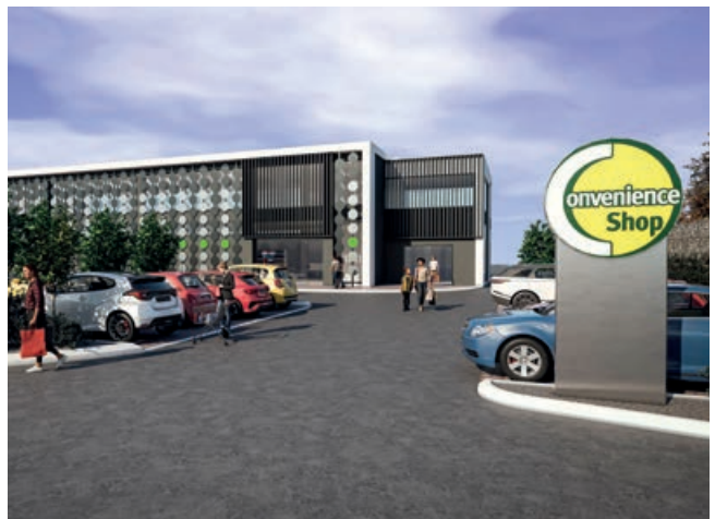
Rendered image of the new Head Office in Qormi.

Looking to our vision for 2026 and our commitment to innovation, we will also invest heavily in cutting-edge technology solutions, including a new Enterprise Resource Planning (ERP) system, to streamline our operations, improve decision-making processes, and enhance our supply chain management capabilities.